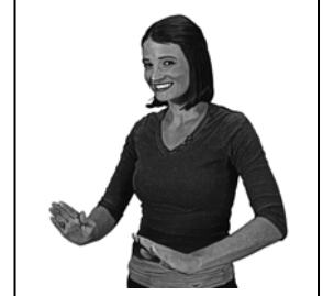
Quiet pos. 2