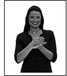
Stop pos. 2