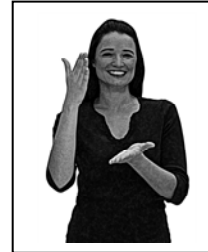
Stop pos. 1