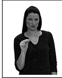
No pos. 2