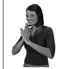
Quiet pos. 1