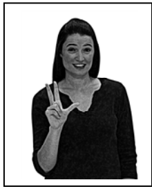
No pos. 1